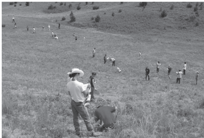
2006 campers participate in a range judging contest.

The Nebraska Section of the Society for Range Management is proud to sponsor this activity each year. The Section is also aware of, and grateful for, the time and effort provided by all the volunteers – many of whom are active Nebraska Section members – who each year help ensure a quality camp that provides both educational and recreational opportunities for the young participants.