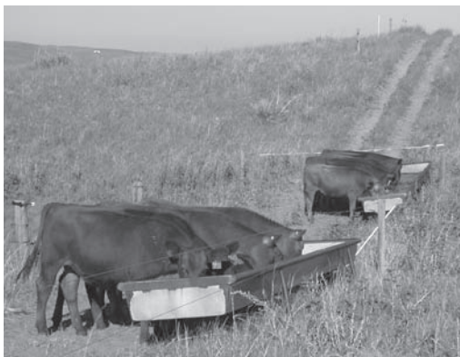
Cattle consuming dried distillers grains in a summer grazing trial at the Gudmundsen Sandhills Laboratory.

The supply of distillers grains (DG) will triple or quadruple in the next few years as the Nebraska ethanol industry grows. The