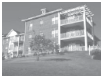
IANR's improved turf-type buffalograsses are used in lawns, public spaces and golf courses around the country, such as this residential development in Lincoln. The water-thrifty grasses are especially popular in watershort areas.