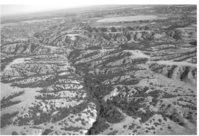
This aerial view of the Loess Canyons shows the abundance of cedar trees in a formerly grassland-dominated landscape.

Cedar, conditions are quite different today. Cedars and other woody species now dominate significant portions of the landscape. The encroachment of woody species has greatly reduced the available acres for grazing.