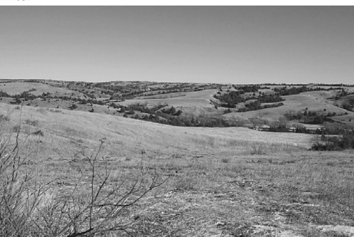
The Landowner Incentives Program, and an endangered insect, have given Loess Canyon rangeland owners an opportunity to regain some of the grassland they have lost over the last 30 years.

to changes in grass species composition. The rangeland is now dominated by cool-season grasses, primarily brome and wheatgrass species. Native warm-season grasses, wildflowers and shrubs have persisted on some of the steeper slopes, but cannot compete with the cool-season grasses under current conditions. An ongoing drought has added to the dominance of cool-season grasses, as spring moisture is consumed by cool-season species, and a lack of summer precipitation for several years has prevented reproduction by warm-season species.