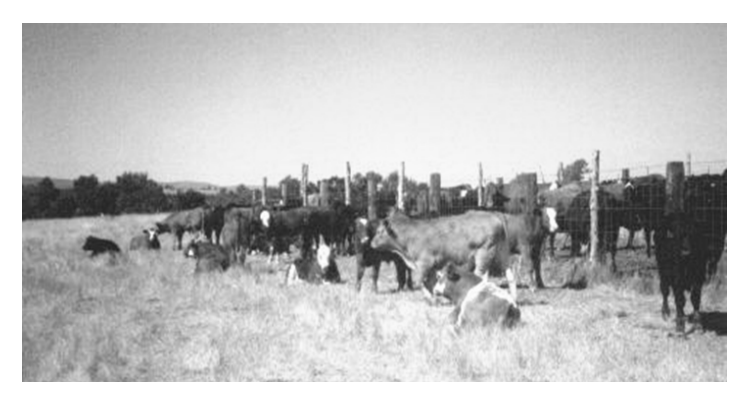
Fence line weaning appears to lower stress on calves. Note several calves are lying down two hours after being separated from their mothers.

If the spring grass is looking adequate and a decision is made to stock the ranges at the normal rate, and later