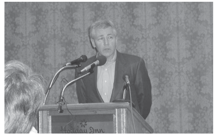
Senator Chuck Hagel kicks off the 2002 Nebraska Grazing Conference by talking about the recently passed Farm Bill and the importance of vital rural economies.

can help make your grazing lands more productive and profitable; controlling cedar trees; how grazing is one of the tools used to manage Spring Creek Prairie to achieve the multiple goals of increasing the diversity of native species and decreasing exotic and invasive species; marketing outlook for cattle; and much more!