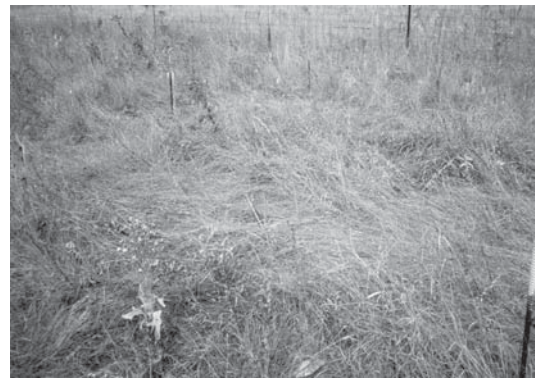
Low species diversity at highest fertilization rate.

regions, which can pose threats to human health. Increasing the supply of nitrogen (supply rate) makes it easier for weedy, often exotic species to become established, and has also been shown to decrease local plant diversity.