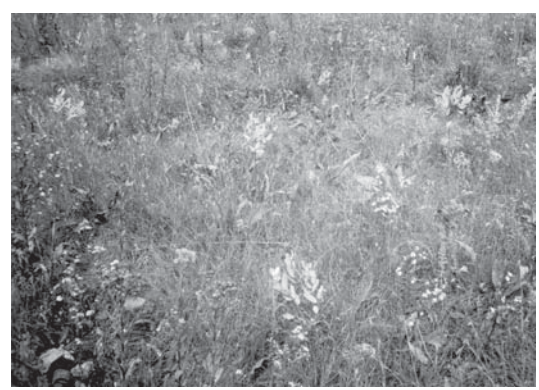
High species diversity when no fertilizer is used.

and coastal waters where it is a major pollutant, and increased nitrate levels in the ground water of agricultural