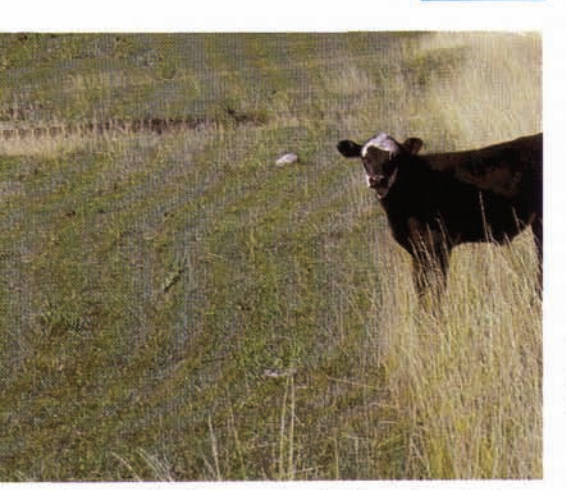
Overgrazed cool-season pasture in July: cattle are ahead of grass.

enerally, plants are not capable of supporting rapid growth in their shoots and roots simultaneously for an extended period of time. If pastures are grazed severely, root growth stops and roots may die back. If overgrazing continues, the grass has little leaf area to carry on photosynthesis so the plant is low in energy. Leaf growth has "first call" on carbohydrates from photosynthesis so there is no downward movement of carbohydrates for root growth. Roots then die back and the plant has only enough energy to maintain a shallow root system. The result is a pasture that is much more susceptible to environmental factors such as dry weather. Some plants may die out allowing weeds to invade (Fig. 9). Even if plants stay alive, there may be enough open ground for weeds to establish if they have little competition for light. This whole process accelerates as unfavorable conditions increase. The pasture begins a downward spiral which ends when the desirable pasture plants are replaced by plants that are grazing resistant because of low palatability or short growth form.