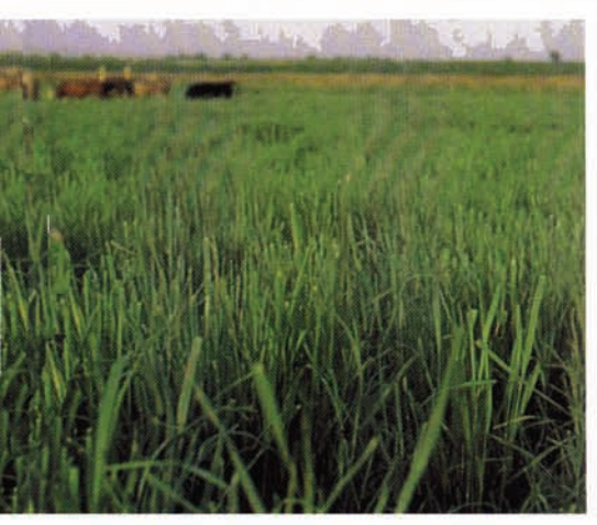
Tall grasses can be evenly grazed when grazing animals are controlled.