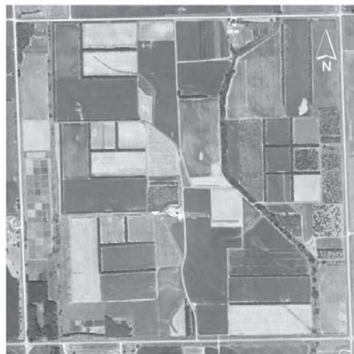
UNL ARDC Agroforestry Research Farm

Associated biodiversity – Species and ecosystems that interact with farm systems but are not typically managed for as part of a farm operation.