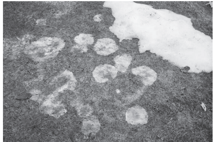
Gray snow mold March 1, 2010, Lincoln, NE.

Low-temperature kill is caused by ice crystal formation at temperatures below 32 degrees F. Factors that affect low-temperature kill include hardiness level, freezing rate, thawing rate, number of times frozen, and post-thawing treatment (Beard, 1973). Soil temperature is more critical than air temperature for low-temperature kill because the crown of the plant is at or near the soil surface. It is difficult to provide absolute killing temperatures because of the numerous factors involved. Beard (1973) provided a general ranking of low-temperature hardiness for turfgrass species that were autumn-hardened.