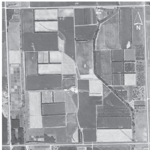
UNL ARDC Agroforestry Research Farm

Associated biodiversity – Species and ecosystems that interact with farm systems but are not typically managed for as part of a farm operation.