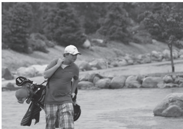
Campers couldn't ask for a better setting in which to perfect their game than Wilderness Ridge Golf Club.