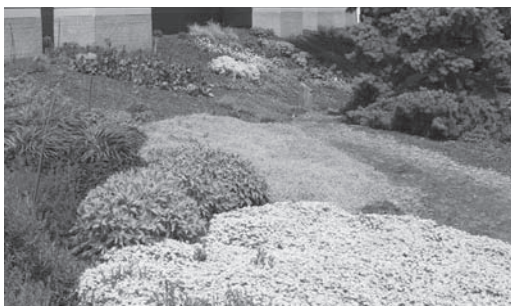
A steep slope is colonized by moss phlox, snow-in-summer, sedums and cranesbills.

Groundcover selection should be carefully researched prior to planting. Would the planting site be best suited to a groundcover less than 4 inches in mature height or better suited to a plant of greater stature? Is the site heavily shaded? Does it receive morning