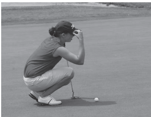
Now what was it the instructor said about lining up a putt?

The daily schedule consists of breakfast, instruction in the