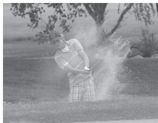
Is all this sand supposed to fly up like that?

(There was a milestone birthday in the mix, but we won't mention that!)