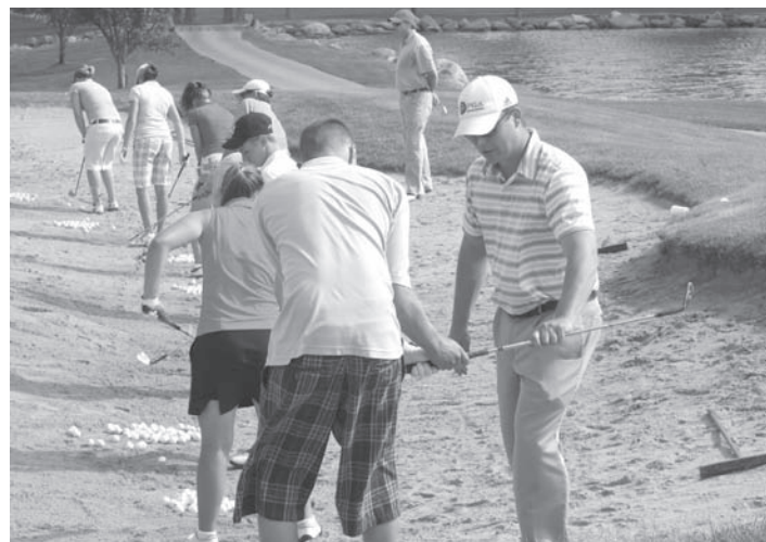
Students in the 2008 Nike Camp learn how to properly shoot their way out of a bunker.