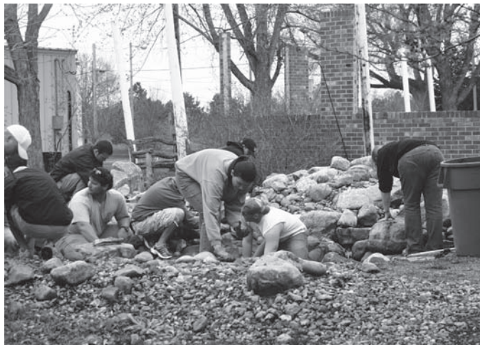
Turfgrass and Landscape Management students get hands-on experience building a pond with waterfall in one of their landscape management courses.