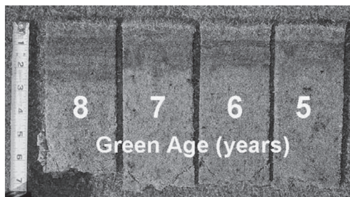
Profiles taken from USGA 80:20 (sand:peat) greens collected 15 June 2004 at the JSA Turfgrass Research Facility near Mead, NE. Once established, formation of amt is increasing approximately 6.5 mm (0.25”) annually and ranges from 5cm (2”) to 7cm (2.75”) for 5-year and 8-year greens, respectively.

Research was conducted at the University of Nebraska John Seaton Anderson Turfgrass Research Facility near Mead, NE. Four experimental greens were constructed following USGA specifications in sequential years from 1997 to 2000. Treatments included two rootzones – 80:20 (v:v) sand and sphagnum peat and an 80:15:5 (v:v:v) sand, sphagnum peat, and soil (silty clay loam), and two establishment grow-in programs – accelerated and controlled. Establishment treatments were based on recommendations gathered by surveying golf course superintendents and a USGA agronomist with experience in establishing putting greens. The accelerated establishment treatment included high nutrient inputs and was intended to speed, or decrease time for, turfgrass cover development and readiness for play. The controlled establishment treatment was based on agronomically sound turfgrass nutrition requirements. Plots were seeded with “Providence” creeping bentgrass ( Agrostis stolonifera Huds.) at 1.5 lbs per 1000 ft 2 . During the establishment year, the total amount of N, P, and K of the accelerated establishment treatment was two times and four times the amount of the controlled establishment treatment for pre-plant and post-plant, respectively.