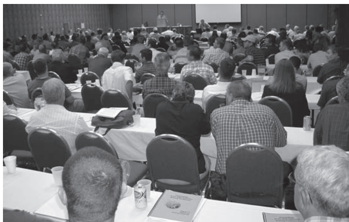
A packed ballroom listened to Byron Shelton from Colorado discuss holistic grazing planning.

The sixth annual Nebraska Grazing Conference held August 7-8, 2006 was the most successful so far, with 253 participants from 11 states, 25 presenters, and 22 sponsors (19 of whom exhibited). There was also greater involvement of college students – both in the audience and at the podium. Topics included using animal behavior to manage grazing, measuring success in grazing management, grazing yearlings, irrigated pastures, holistic grazing, setting up grazing systems, winter and summer grazing options, breeding grasses for improved beef cattle income per acre, integrating pasture with row crop production, promoting grassland biodiversity, conservation easements, and the interaction of grazing and wildlife.