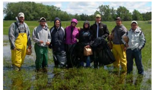
UNL's meadow-clipping crew takes a break from field work.

For more information visit online.unl.edu/gm .