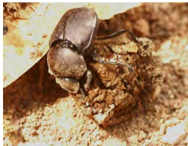
The dung beetle Canthon pilularius in the process of forming a dung ball to roll away and bury elsewhere.

Up to 56% of cattle in the U.S. are treated with insecticides to control dipterans and internal parasites. Some veterinary pharmaceuticals can reduce survival and be fatal to dung beetle populations. If treatment is necessary, it is recommended to be done when dung beetles are inactive or by using dusts and sprays.