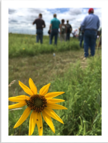
Stiff sunflower seen on the plant identification tour.

Approximately 84% of all conference survey respondents indicated that they were likely to very likely to make changes from knowledge gained at this conference. Survey respondents specified owning, managing, or influencing 1.4 million grazing lands acres with hay production and cropland grazing representing an additional 27,000 and 45,000 acres, respectively. Survey respondents also owned, managed, or influenced 42,019 beef cows, 1,300 bison, and over 4,000 small ruminants. Estimated knowledge gained from the 2019 Nebraska Grazing Conference would increase profitability $20.90 per head on an average herd size of 1,050 beef cows. While the total program value for the Nebraska Grazing would likely be greater, program value for 40 conference respondents who owned, managed, or influenced beef cows only was over $875,000. This speaks to the quality of the program and also to the future of managing the grassland resources in Nebraska and the Great Plains.