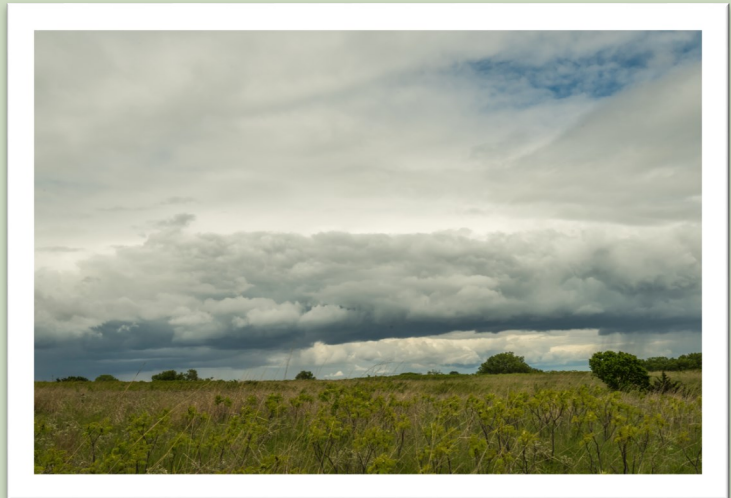
Nine-Mile Prairie landscape.

The Nine-Mile Prairie Advisory Council has been exploring opportunities to collaborate with the City of Lincoln's Prairie Corridor on Haines Branch project as well as obtaining formal integration of Nine-Mile Prairie into the planning and vision of the Lincoln and Lancaster County 2040 Comprehensive Plan. As part of these discussions, the importance of land use buffers surrounding Nine-Mile Prairie became an immediate priority to preserve for posterity the integrity of the Nine-Mile Prairie. The goal is to encourage and facilitate land management that is compatible with prairie conservation at Nine-Mile Prairie and sustainable grassland management in the surrounding public and privately-owned landscape through an extended management and utilization philosophy that creates a lasting land buffer. The development of a long range management plan for Nine-Mile Prairie and management strategies for its surrounding environs is essential for long-term prairie preservation and will honor Nebraska's prairie legacy while ensuring that all future generations have the opportunity to enjoy and learn from our native grasslands.