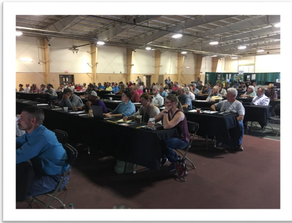
Participants listening to one of the 18 speaker presentations at the Nebraska Grazing Conference session.

The original goal for this year's Nebraska Grazing Conference was to build on enhancing traditional grazing lands management practices and provide insight for implementing practices that support the stewardship of grasslands and grazing lands resources throughout Nebraska and the Great Plains. This year's conference was a bit "different" than some of the past conferences due to the flooding that occurred in Kearney during early July. The only thing that remained rather constant was the program.