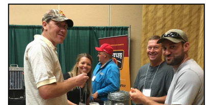
Social time provides networking opportunities.