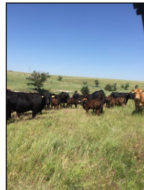
Bar Arrow cattle grazing in pasture.