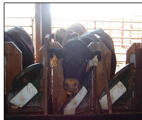
Pasture-grazed yearlings are gathered to receive individual supplements.

The RUP sources in these trials cost approximately $0.70 per lb of RUP. This means that the extra gain cost $1.32/lb. Determining if supplemental RUP is economical depends on the RUP sources available to producers. Distillers grains (DG) are a good source of RUP and are readily available in Nebraska. Assuming DG are 30-32% CP and 63% RUP, if purchased for $150/ton the DG would price into an operation between $0.35 to $0.40 per lb of RUP. This calculates to paying between $0.66 to $0.75 per lb of additional gain. The delivered price of DG is quite variable and is dependent on distance from ethanol plants and the ability to store and feed DG. The DG would also supply extra energy to the cattle that the RUP sources in these studies did not provide. This energy could boost ADG even more. A 10-year summary of calves grazing smooth brome grass and supplemented with DG had an ADG response of 0.67 lb per lb of RUP from DG. It is important to take into consideration the cost of the RUP supplement and the type of forage being grazed to determine if RUP supplementation is profitable.