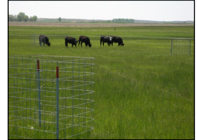
Figure 1. Steers grazing pastures on the subirrigated meadow at the Barta Brothers Ranch.

For the two grazing systems and four years of the study, estimates of forage intake were better predicted by the 2.3% of liveweight factor than the 2.7% of liveweight factor. Other research conducted by the University of Nebraska-Lincoln found that dry matter intake of cows and heifers was 2.23% of liveweight when the cattle were fed subirrigated meadow hay in confinement and at free choice. These results confirm that the AUD equivalent of 23 lbs DM/AUD used by Nebraska Extension is reasonably accurate.