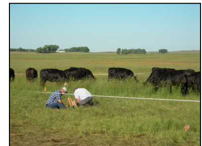
Figure 2. Clipping standing plant biomass immediately after grazing.