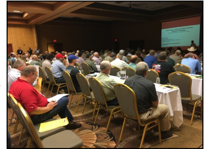
Diverse presentations offered something for everyone at the NGC.