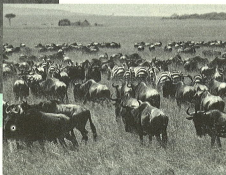
Wildebeest and zebra on grassland in Namibia.

managed for an ecotourism industry. Namibia has become a destination for trophy hunters and a variety of ecotourists. A huge challenge for land managers and the ecotourism industry, however, has been the encroachment and thickening of woody plants on the grasslands and savannas. Especially from a hunting and ecotourism perspective, this conversion not only affects habitat for the valuable wildlife species, but also changes the “typical” grassland/savanna appearance expected by tourists in Africa.