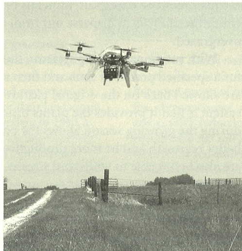
Figure 1. Multi-rotor radio controlled aircraft used for data collection.