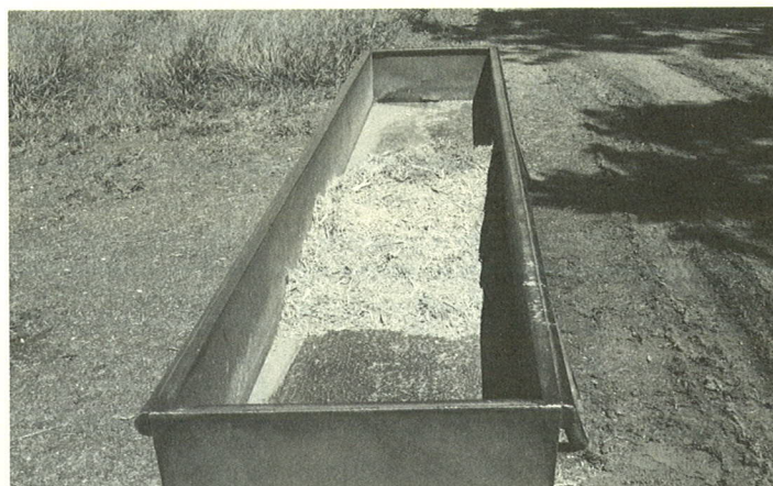
Feed bunk with a mixture of 30:70 modified distillers grains to ground cornstalks (DM basis); supplemented to pairs on grass to reduce grazed forage intake.

The following year, a similar trial was conducted using cows with spring-born calves at side grazing smooth bromegrass pastures. Pairs were assigned to either a traditional stocking rate without supplementation or double stocked with supplementation. Again, supplementation levels were increased as the season advanced to replace approximately 50% of grazed forage intake (DM basis). In this experiment, a mixture of 50:50 modified distillers grains:cornstalks (DM basis) was used at the start of the season to encourage consumption while forage quality was high. Distillers grains were gradually removed from the supplement until a ratio of 30:70 co-product:forage was reached. Cow and calf gains were greater for supplemented pairs. However, grazed forage replacement rates were slightly less than the previous year. The modified distillers grains and cornstalk mixture reduced grazed forage intake by 33%. Thus, every lb of supplement replaced about 0.9 lbs of grazed intake. This experiment is being replicated this season to further evaluate replacement rates on cool-season pastures. Our data indicate using mixtures of low-quality forage and co-products to reduce grazed intake is more successful on smooth bromegrass pastures in eastern Nebraska than on Sandhills upland range. Smooth bromegrass pastures may be more resilient to overgraz-