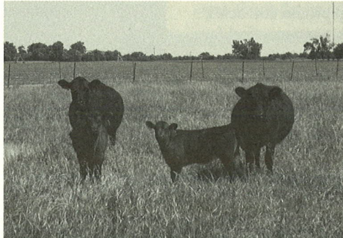
Cow-calf pairs grazing smooth bromegrass pasture in eastern Nebraska in late May.

Research was initially conducted in 2007 at the Gudmundsen Sandhills Laboratory near Whitman, NE (2010 Nebraska Beef Cattle Report, p. 19). Cows with spring-born calves were assigned to one of three treatments: 1) stocked at the recommended stocking rate (0.6 AUM/acre) with no supplementation; 2) double stocked (1.2 AUM/acre) and supplemented with 14.6 lbs/hd/d (50% of estimated DMI) of a distillers grains/forage mixture; and 3) double stocked (1.2 AUM/acre) with no supplementation. The supple-