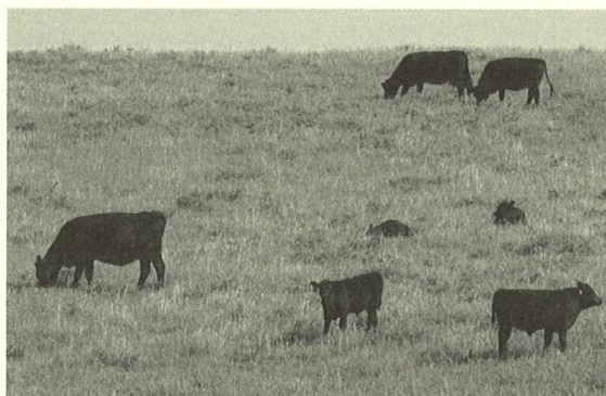
Figure 1. Cow/calf pairs on upland range at the Barta Brothers Ranch.

Grazing systems define the arrangement of grazing and non-grazing periods within a grazing season and/or year. A grazing system should be looked at as a tool used to achieve enterprise goals and objectives within a set of environmental, economic, resource, and management factors. There is an endless number of potential grazing systems because a grazing system should be custom-made for each situation. Conceptually, there are three categories of grazing systems used in the Nebraska Sandhills: season-long continuous grazing, deferred-rotation grazing, and short duration or management intensive grazing. This review of grazing systems will be based largely on a 10-year research project conducted at the University of Nebraska's Barta Brothers Ranch (BBR) located about 30 km south of Long Pine, Nebraska.