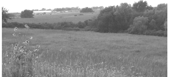
Development threats don't always come from physically harming grasslands. Views like this from Nine-Mile Prairie will change with the addition of 115-foot-tall power line towers. Such adjacent aesthetic harm is difficult to gage, but certainly diminishes the meaning attached to virgin prairie and loosens our psychic connection to the landscape." Richard Sutton

While such removal is dramatic, much more insidious is the degradation of grassland areas and their loss of biodiversity. Invasive species such as leafy spurge can also gain a foothold in grasslands and smother them as surely as woody plants. A portion of the grass area in the buffalo exhibit at Pioneers Park has been under invasion by leafy spurge and has