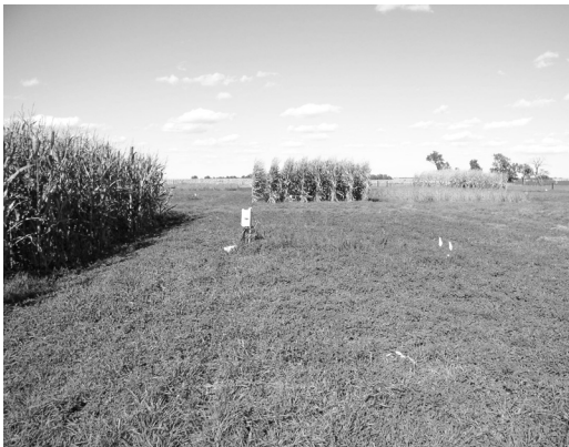
Research plots are yielding data that indicate using high-nitrate irrigation on grass results in net removal of nitrogen.