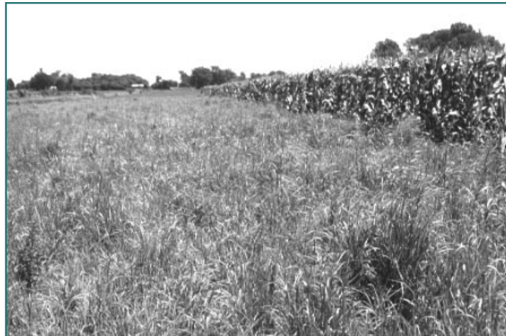
Grass Buffer in Riparian Zone

Grass buffers in uplands and riparian zones are tracts of land with permanent grass cover. The purposes of buffers are to (1) remove contaminants in water that is flowing to the stream, (2) improve the stream environment and stabilize the banks, (3) enhance wildlife habitat, and (4) provide for biological diversity in the landscape. Sediment removal from water flowing on the land surface is one of the key water quality benefits of conservation buffers.