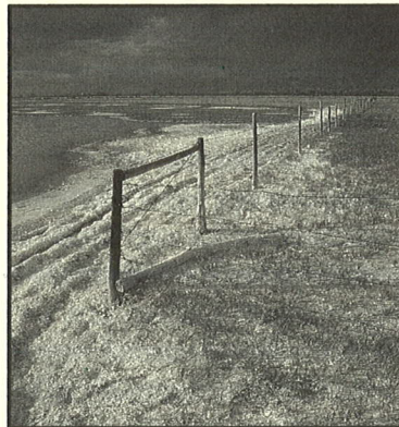
Nebraska Game & Parks Commission

Within the North Platte Valley's alkaline wetlands, the shallow pools where salts accumulate are the harshest growing environment for plants. There, plants must tolerate not only standing water in spring, but also dry and extremely alkaline soils in late summer. Stunted scattered plants of arrowgrass, an exceedingly salt-tolerant, grass-like forb, are frequently the sole inhabitants of highly alkaline depressions. Sea blite, alkali plantain, Nevada bulrush and inland saltgrass can survive in less alkaline depressions. Like most halophytes (plants adapted to grow on salty soils) these plants have the ability to accumulate higher concentrations of salts in their cell sap than salt concentrations in the soil water. By concentrating salts, these halophytes can draw soil water into their roots, since water generally flows from areas of low salt concentration to areas of higher salt concentrations.